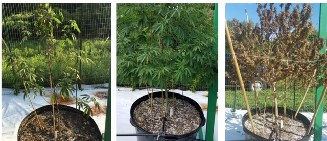
Figure 1: Typical growth and maturation of Cannabis following addition of Sustane Natural Fertilizer. Plant 2.2 shown at time of initial transplant (left), top dress treatment (center), and just prior to harvest (right).

All plants responded well to added fertility, regardless of rate applied. While about 10% of plants initially showed signs of transplant shock (e.g. yellowing whitening of leaves upon outside placement), all signs of stress were relieved by four weeks post-transplant. Rainfall was above normal and adequate supplemental irrigation was provided.