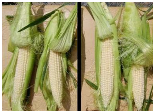
2 ears (left) were fertilized with Composted Chicken Manure, 2 ears (right) fertilized with Sustane. Photos taken August 14, 2012, 65 days after planting.